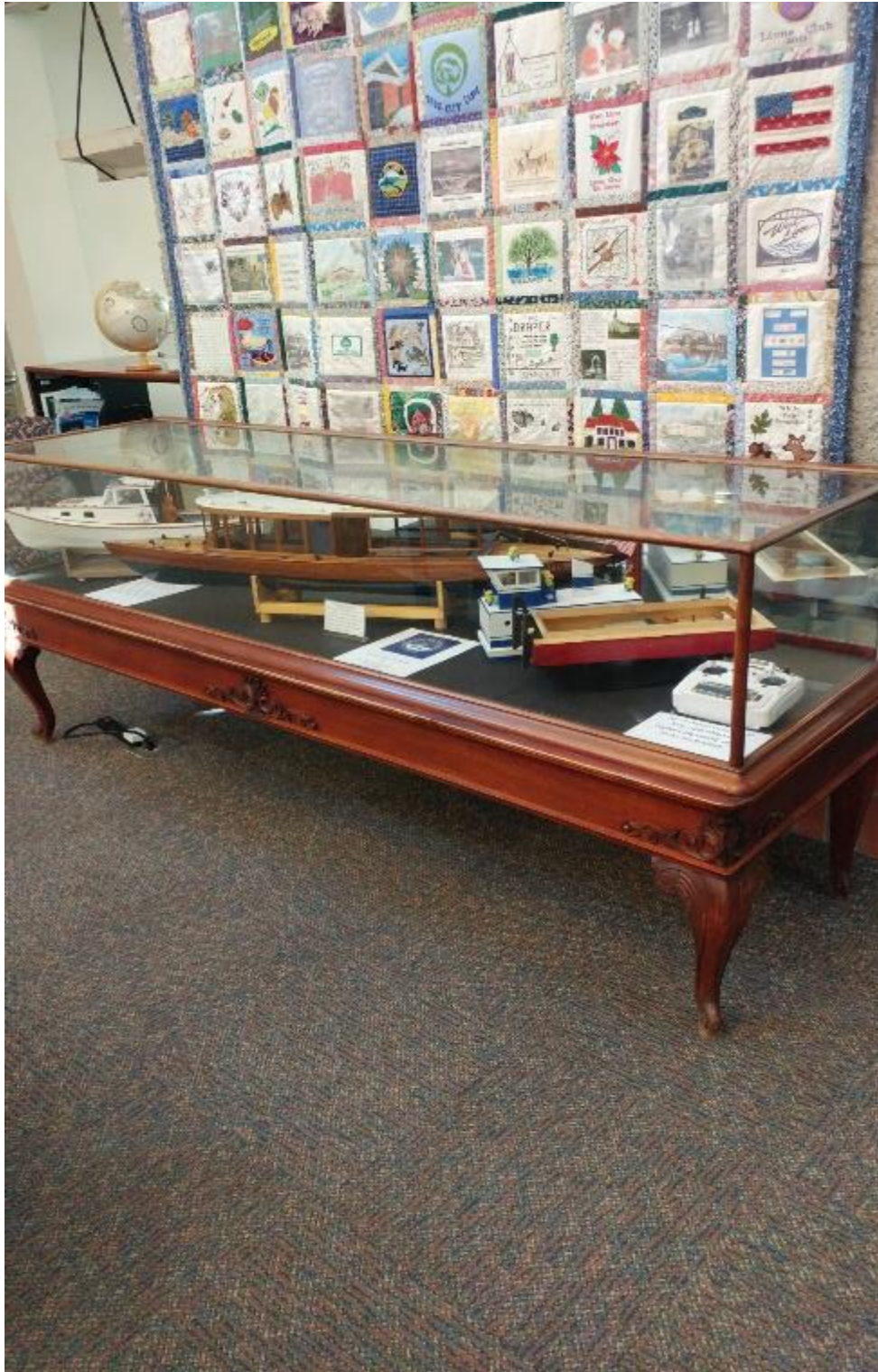
West Linn Library display case where we have some boats