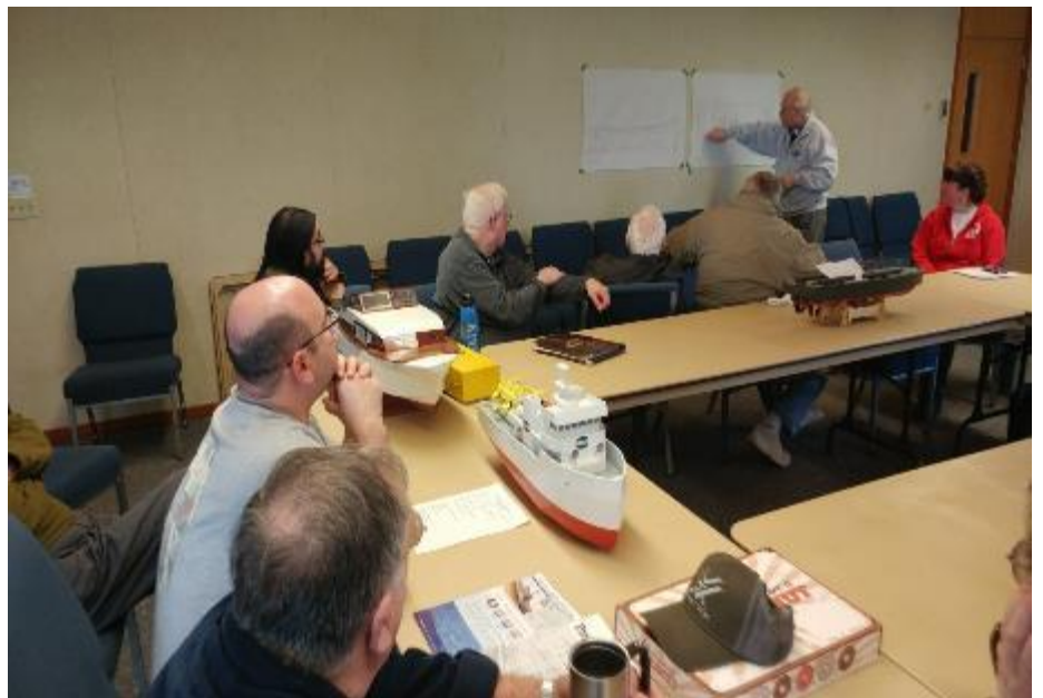
Club General Meeting for February 2018

Apr 28 – First float of 2018 – Tualatin 10am